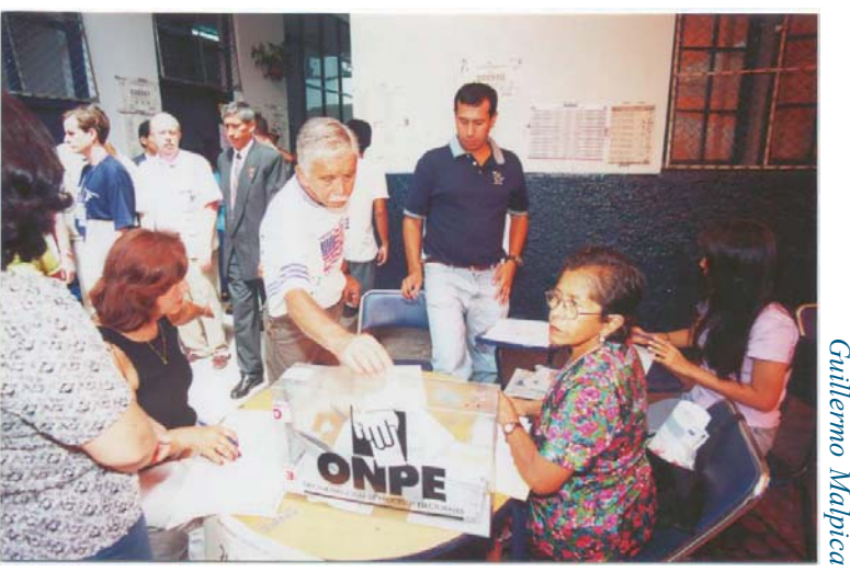
A Peruvian voter deposits his ballot in a tamper-proof box.

In the final ballot tabulation, there is an almost nonexistent error rate. Early reports in the April 8 election revealed only two challenged or disputed ballots out of every 10,000 counted. Official returns from individual voting places are delivered by hand to 57 counting centers, where they are entered on computers and then transmitted to central election headquarters in Lima. A small group of distinguished jurists, with constitutional authority, makes final decisions over the entire procedure and resolves any possible disputes. Few of these constraints or guarantees exist in the United States. Our voters lists have no guarantee of being either current or accurate. Instead of an authoritative and trusted governing body supervising a standard system, we have at least 50 separate state procedures and, it might be