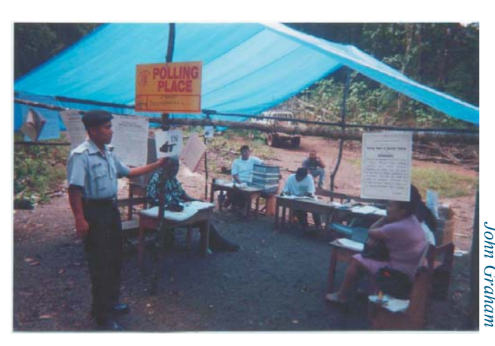
Poll workers prepare for the vote in Guyana in March 2001.

The challenges of openness and inclusion for new democracies became clear again in Guyana, where this spring's general elections met international standards only to be marred by post-election street violence and lingering doubts about the accuracy of the voters list. Racial divisions and distrust between the two biggest political parties have hindered efforts to move the relatively undeveloped nation forward. The Carter