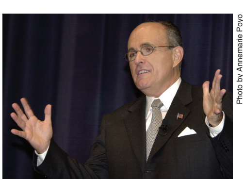
Former New York City Mayor Rudolph Giuliani emphasizes his understanding of the need for mental health services.

events like Sept. 11 in the future. The idea of bringing together experts in mental health is a very big contribution to the security of this country," said Giuliani.