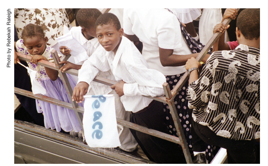
A boy's sign indicates his wish at a march for peace outside Kingston.

Jamaica's Electoral Advisory Committee invited The Carter Center to observe its parliamentary elections in 1997 and 2002, hoping to deter electionrelated violence. The outbreak of violence during the 1980 election killed more than 800 people. Yet in 1997 and 2002, when Jamaica invited international observers, election-related violence in the "garrison" communities controlled by politically related armed gangs was reduced.